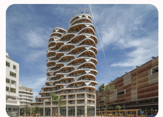
HIGHER ROCH Montpellier, France Brenac & Gonzalez & Associés