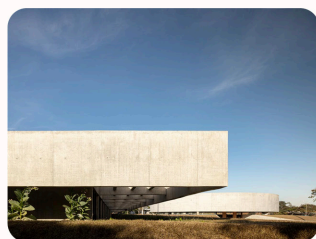
CHURCH OF THE HOLY FAMILY Brasilia, Brazil ARQBR Arquitetura e Urbanismo