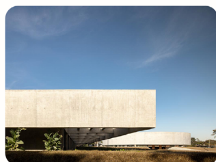
CHURCH OF THE HOLY FAMILY Brasilia, Brazil ARQBR Arquitetura e Urbanismo