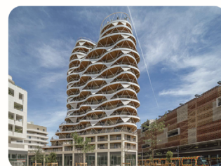
HIGHER ROCH Montpellier, France Brenac & Gonzalez & Associés